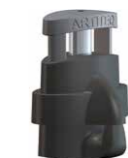
MICRO GRIP LOCK 2 mm 30.41250 | 20 kg