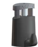
MICRO GRIP 2 mm 30.41200 | 20 kg